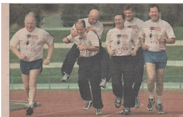
+ MARATHON MEN: Six "don't stop 'til you drop" runners.

The 1999 Adelaide Marathon was memorable for being the sixth and final time the Magnificent Seven all finished. To celebrate the 21 st running of the event The Advertiser published an article about the Seven even though only six could attend the photography session at the athletics stadium at Mile End.